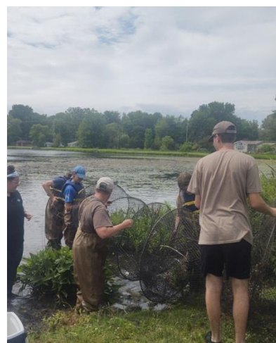
Watery World of Fish-MI DNR